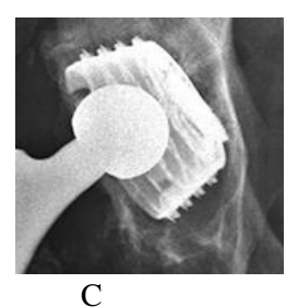
Figure 2 : Cup osseointegration A : good B: Ssatisfactory C:Unsatisfactory (unstable component)

Osseointegration of the femoral component of the endoprosthesis was regarded as