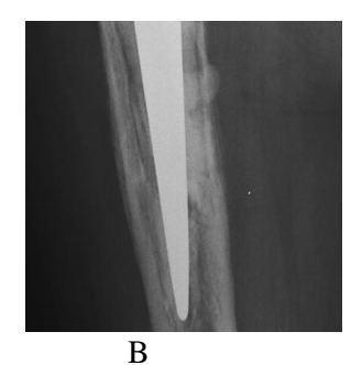
Figure 5 : Loosening of the cemented cup and stem A: Osteolysis of more than 2 mm width; B: breakage of the cement mantle