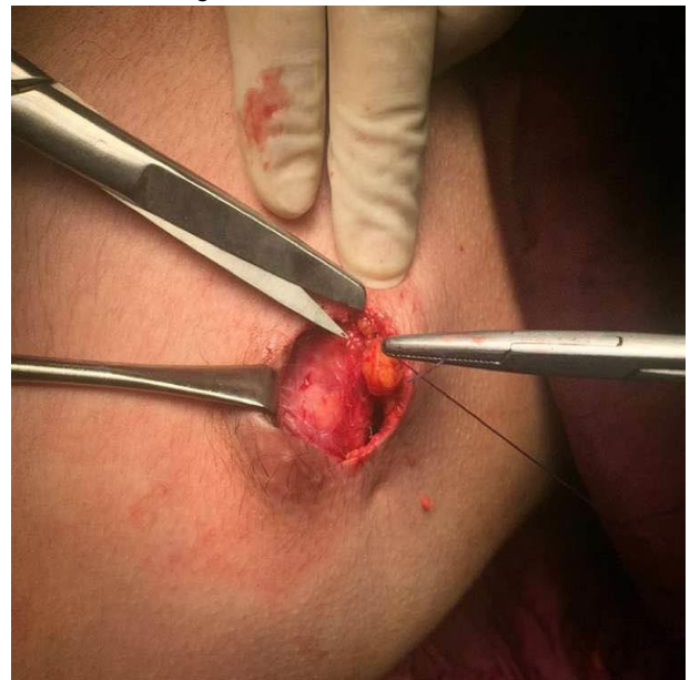
(Figure 5) Quilting suture between skin flap and derlying fascia

Figure 6 (a &b) Simon 3 Gynecomastia preoperative marking and the post-operative result