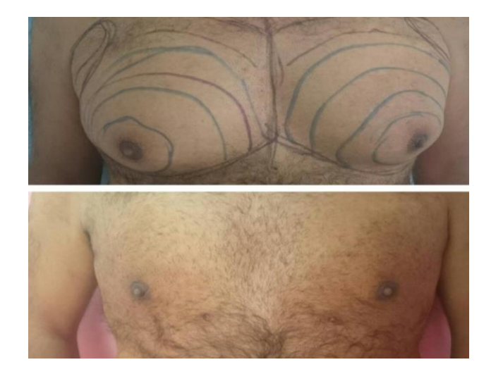
Figure 6 (a &b) Simon 3 Gynecomastia preoperative marking and the post-operative result