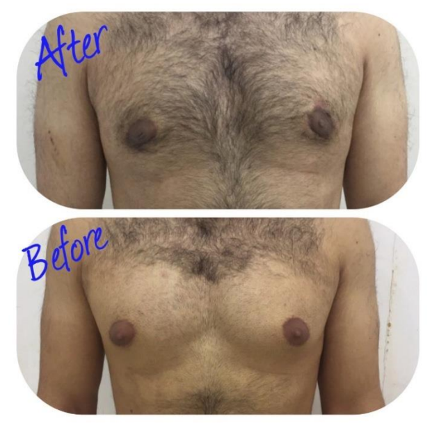
Figure 8 (a) Showing anteroir Simon 2B veiws befor and after operation