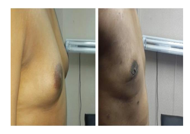
Figures (b) Lateral views with Simon 3 befor and after operative