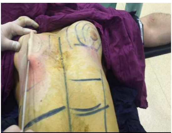
Figure (1)Lliposuction of the breas