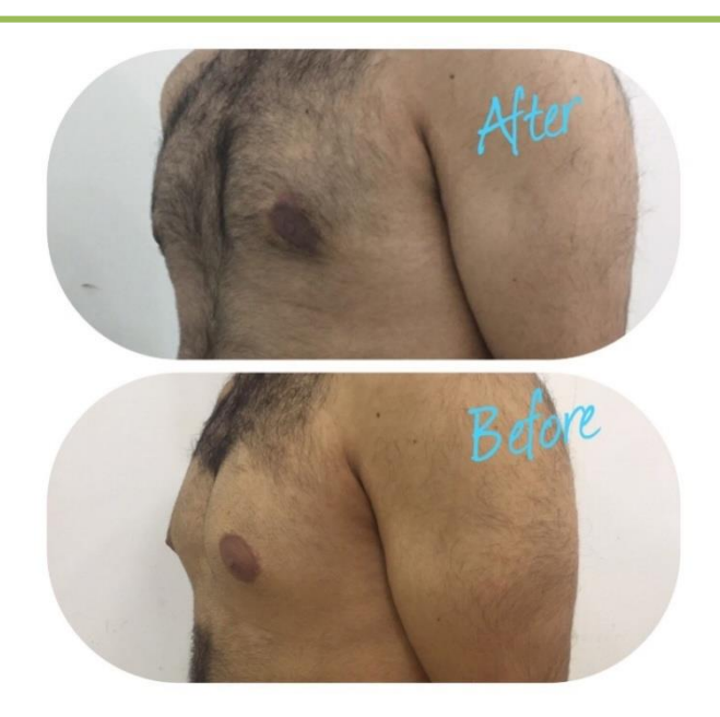
Figure 8 (b) Showing Simon 2B oblique view before and after