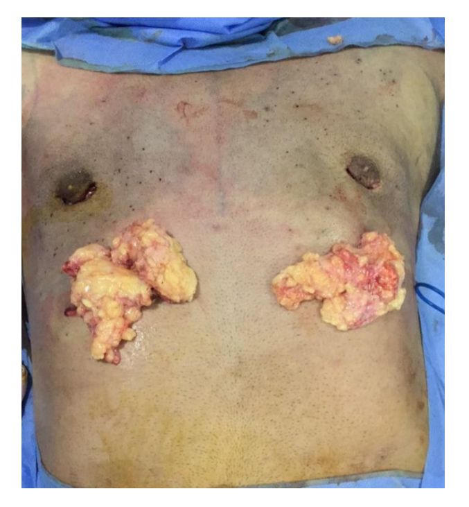
Figure (2) Periareolar approach for removal of the fibro glandular breast tissue .