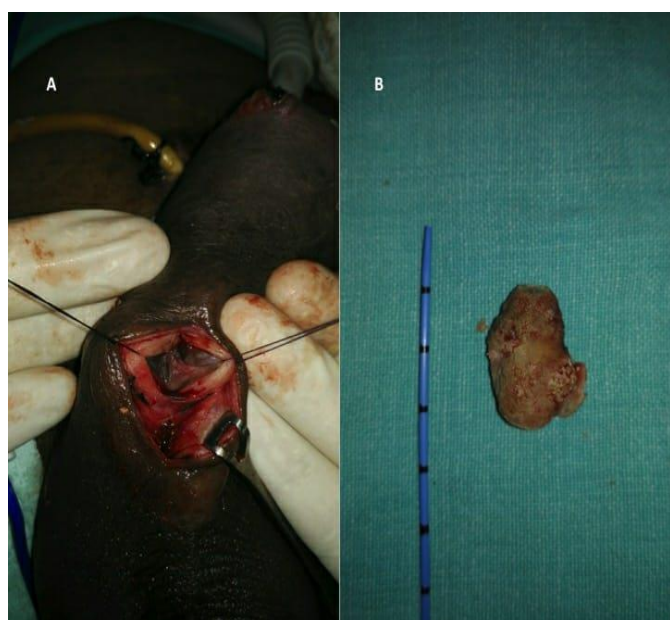
Figure 3. Intraoperatively, a large calculus measuring 30x25 mm was found in the urethral diverticulum arising just proximal to the short segment urethral stricture.