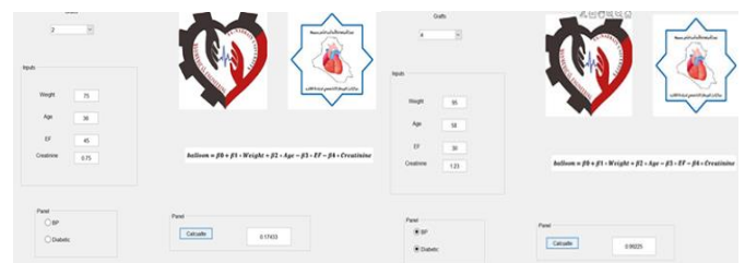
Figure 3: GUI with different patient's data

The prediction model was applied to several patients to determine the percentage of patients who would require IABP during CABG surgery. For a specific patient with the following characteristics: 2 grafts, weight of 75 kg, age of 36 years, EF% of 45%, creatinine level of 0.754, normal blood pressure, and no diabetes, the prediction percentage was determined to be 17.4% that this patient would require the balloon during the CABG surgery. Conversely, in the case of a patient undergoing 4 grafts, the patient weighed 95kg, was 58 years old, had an EF ratio of 30%, and a creatinine level of 1.23. Additionally, the patient had hypertension and diabetes. The findings indicated a 99.2% likelihood that the patient would require a post-operative balloon (as the figure 3 show).