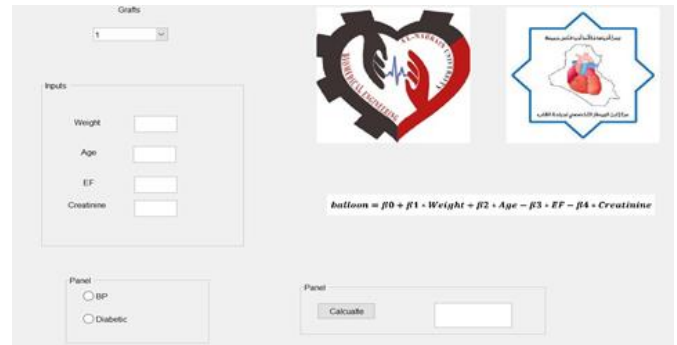
Figure 2: Graphical User Interface System

correlation, while negative coefficients indicate a negative correlation. Every equation corresponds to a distinct scenario determined by the number of grafts, blood pressure, and diabetes state. The graphical user interface (GUI) utilizes a simple framework that's accessible to users who do not have programming skills (as in figure 2). Users such as doctors, perfusionists, and nurses have an interest in uploading the patient's information and obtaining the prediction result immediately (25).