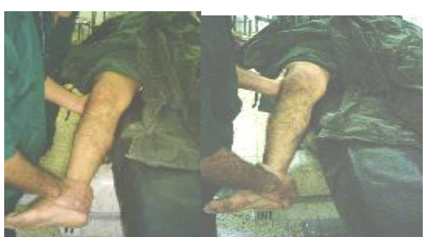
Figure 2: Valgus stress test at 0 and 30 degrees under GA.

affected knee and quadriceps muscle strengthening exercises.