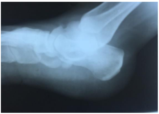
Figure 2: Pre-oparative X ray

Lateral x-ray of both heels in standing position was taken (Fig.2), six patients showed no calcaneal spur, 10 showed unilateral spur on the painful side for which operation was done. None of them showed abnormal pathologies on the plain x-ray or abnormal biomechanical alignment of the foot bones. The heel pad thickness was between (7-11mm) mean of 9mm (normal range is 9.9mm for 20-40 year and 11.5for 41-60 year). X-ray of the knee and lumbar spine were taken to exclude osteoarthritis