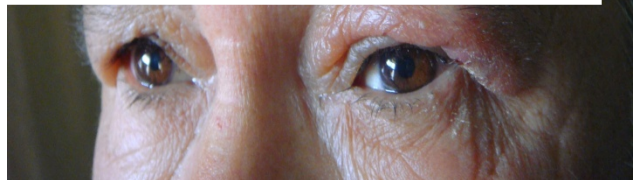
Fig.1 A Herpes simplex like.B plane warts like.C keratoacanthoma like.D styelike