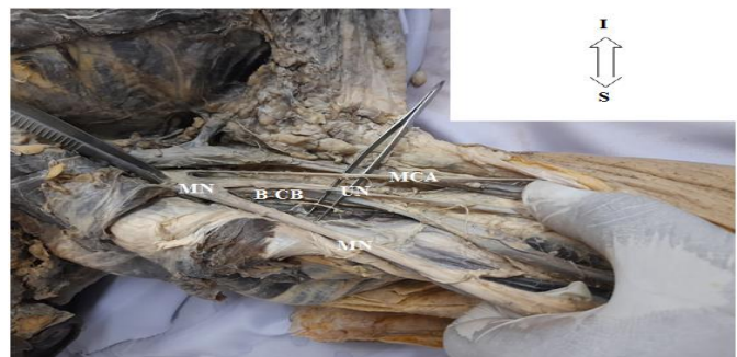
Figure. 3: showing the branches of brachial plexus in the right axillary region. And absence of musculocutaneous nerve, the direct branch from the lateral cord innervates the CB (BCB).

Ishwar B. et al, describes a 58-year-old Indian cadaver observed to be missing a musculocutaneous nerve in both upper limbs and the arm muscles were innervated by the lateral root of the median nerve (7). Sakkarai Jayagandhi et al. mentioned the bilateral absence of the musculocutaneous nerve in two cases in male cadavers aged 60 and 65 years, and the muscles of the anterior arm compartment were innervated by the branches of the median nerve (8). In the present cases, the musculocutaneous nerve was absent on both sides, as for the left side, near the beginning of the median nerve, a branch rose from the median nerve, provide the coracobrachialis, biceps brachii, and brachialis muscles, each with a separate branch supplied. However, on the right side, the coracobrachialis muscle was innervated by a branch from the lateral trunk of the brachial plexus, while the biceps and brachialis were innervated by separate branches directly from the median nerve trunk.